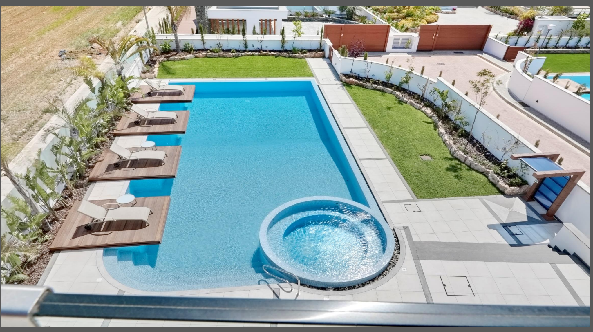
Features include: Central heating, Air conditioning, Garden, Storage, Parking Area, Private swimming pool, Satellite providers, Security Alarm, Roof Garden