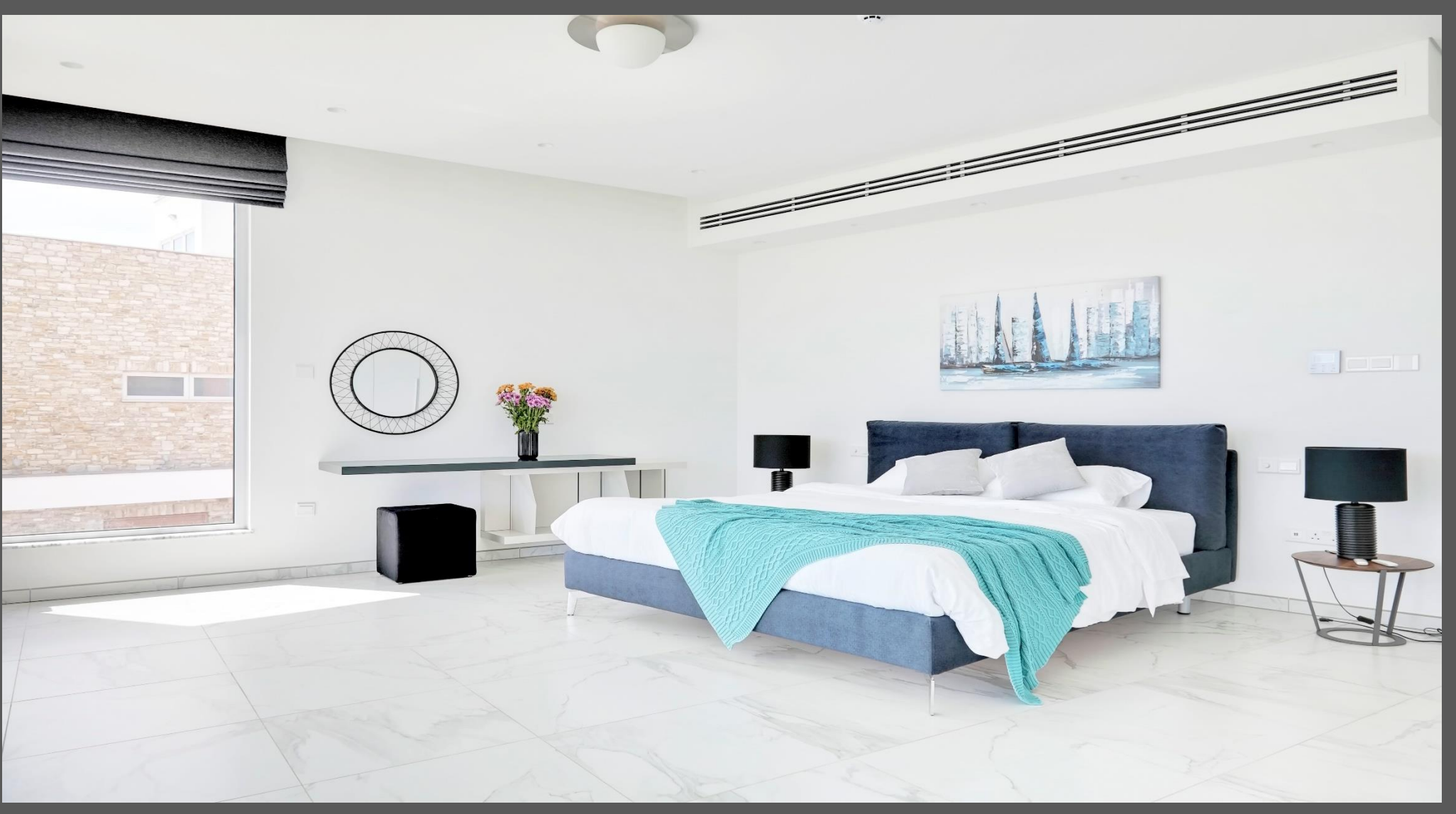
Features include: Central heating, Air conditioning, Garden, Storage, Parking Area, Private swimming pool, Satellite providers, Security Alarm, Roof Garden