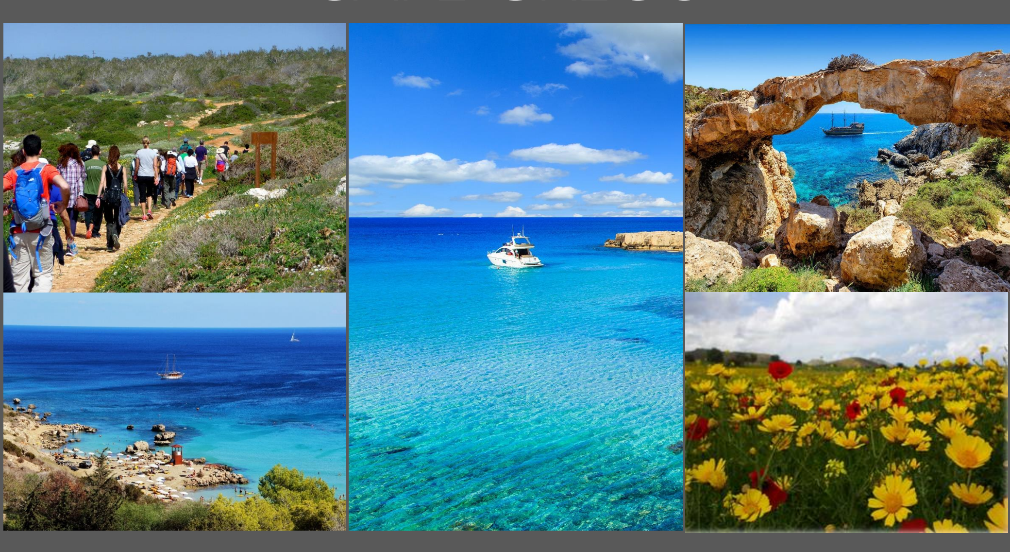
Stunning views to the Mediterranean and its exquisite setting among untouched Cape Greco.